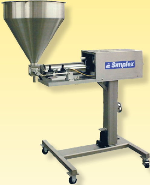
Simplex Model AV-100 with straight spout, product cylinder, 20 gallon hopper and floor stand

Volumetric Piston Filler Single Head, Air-Driven Semi-Automatic