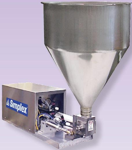
Simplex Model AAS-100 Table-Top with straight spout, prod- uct cylinder and 20 gallon hopper

Volumetric Piston Filler Single-head, Air-Driven Semi-Automatic